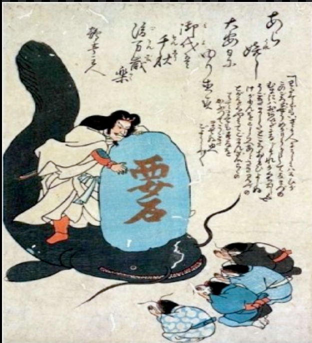
Earthquake Catfish Namazu