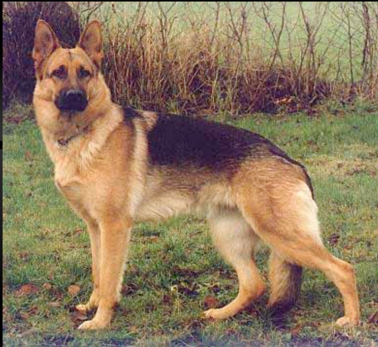
Dogs are able to detect sounds far out of range of the human ear