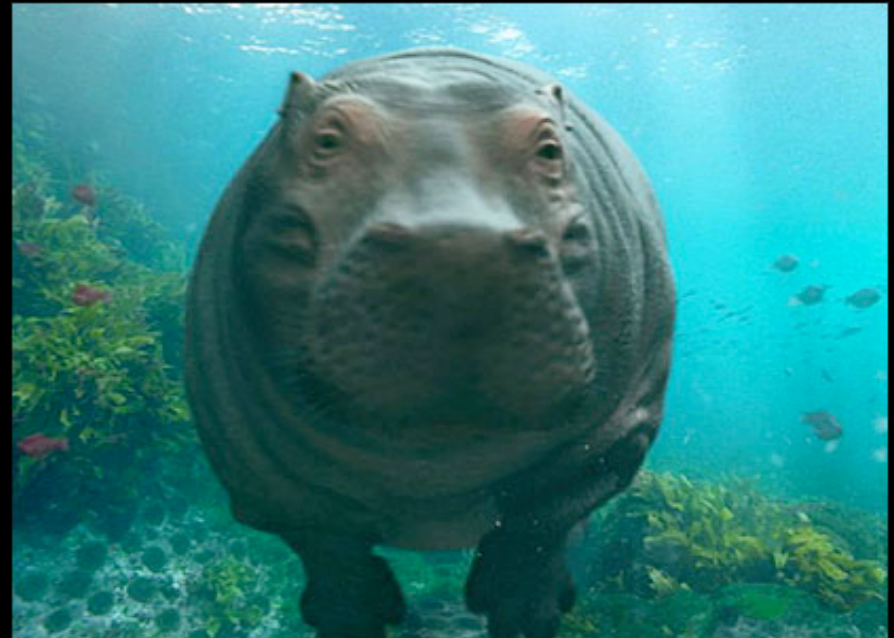
Hippo's can pick up infrasonic soundwaves at great distances